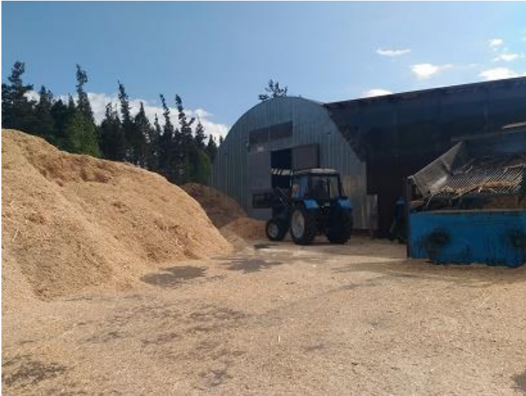
- Overview of biomass manufacturing plant