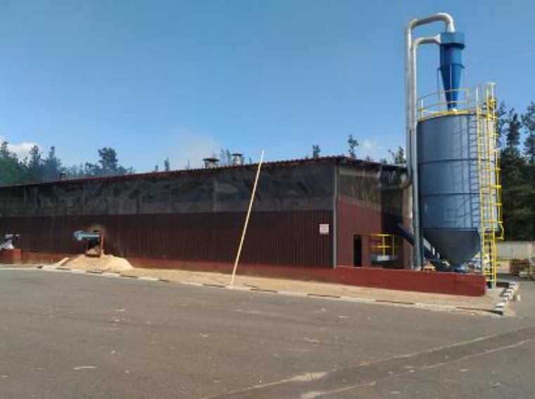
- Dryer(s) (if any)