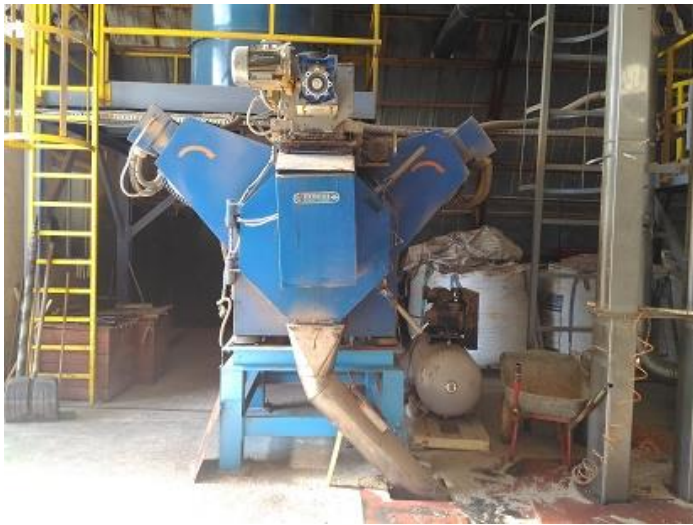
- Biomass storage and handling